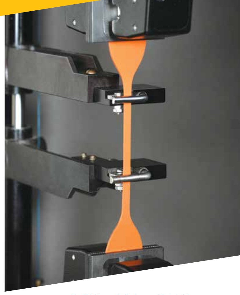
The PPG Monroeville Business and Technical Center houses a full-scale pilot plant and testing laboratory, including tensile testing equipment.