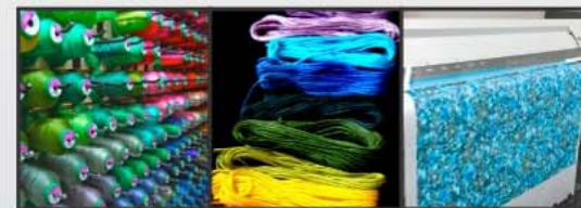
Emulsion paste for Pigment printing