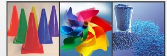
LDPE, HDPE, PVC, Poly propylene, Poly carbonate, Poly styrene, etc.