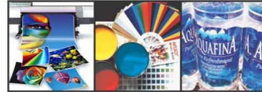
Sheet-fed offset, Web offset, News paper, UV, Screen, Gravure, Flexo

Clean, bright Phthalocyanine Pigments, with very soft texture and outstanding technical properties like light, weather, heat, chemical & solvent fastness. These pigments can be used for various applications with ease. Very high dispersing property allows their suitability for...