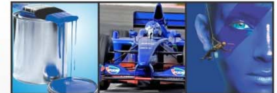
Air drying enamel, Stoving paints, Acrylic paints, Automotive paints, Industrial paints, Cement paints, etc.